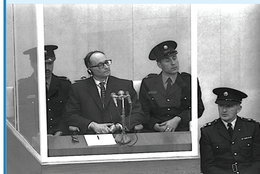
The trial of Nazi war criminal Adolf Eichmann, held at “Beit Ha'am” in Jerusalem. Eichmann sitting in his glass cell, surrounded by guards.

The trial began in April of 1961 and it received extraordinary press and media coverage, which revealed to the American public-at-large, and even more so, to the American Jewish community, the horrors of the Holocaust. After eight months on trial, on December 15 th 1961, Eichmann was sentenced to death for the atrocities he committed during the Holocaust. In June of the following year, Eichmann was hung. The execution of this Nazi is the only time Israel enacted the death sentence.