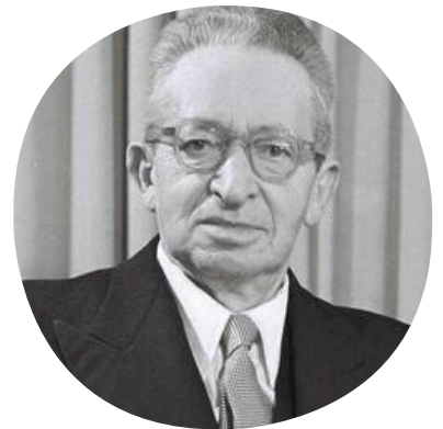
Yitzhak Ben-Tzvi.

Yitzhak Ben-Zvi was known for his modest, living in humble housing while President. He was also a researcher interested in studying the Land of Israel and the different communities who make up the Jewish people. He founded the Institute for the Study of Oriental Jewish Communities in the Middle East in 1948, which was renamed the Ben-Zvi Institute after his death.